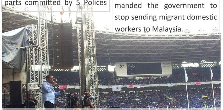
Mudhofir (President KSBSI) was announcing the set up of MP/BI

The 3 Confederations threatened to occupy the embassy of Malaysia in Jakarta if the government of Indonesia was slow to deal with the case. The 3 Confederations also demanded the government to stop sending migrant domestic workers to Malaysia.